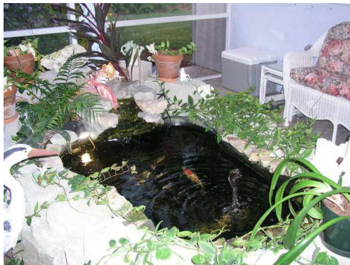
The smaller of the Wilson's two ponds.

fish. Please see information on page two regarding showing fish. We also have help available if you need assistance in catching